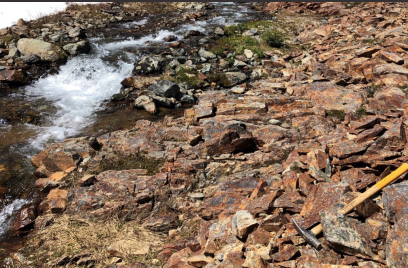
7. AERIALLY EXTENSIVE GOSSAN SHOWING PERVASIVE OXIDATION