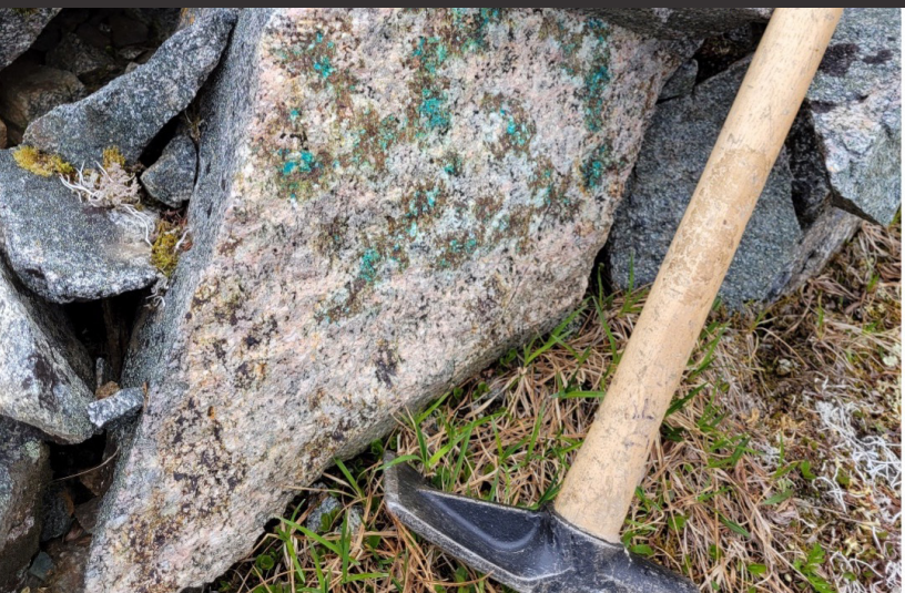
3. GRANITIC OUTCROP WITH MALACHITE STAINING ON QUARTZ FRACTURES