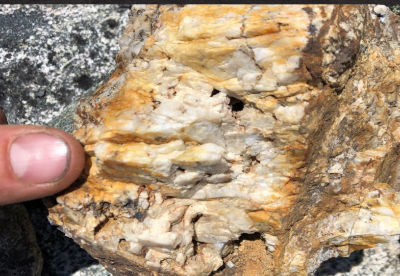
1. VUGGY, OXIDIZED QUARTZ VEIN FLOAT