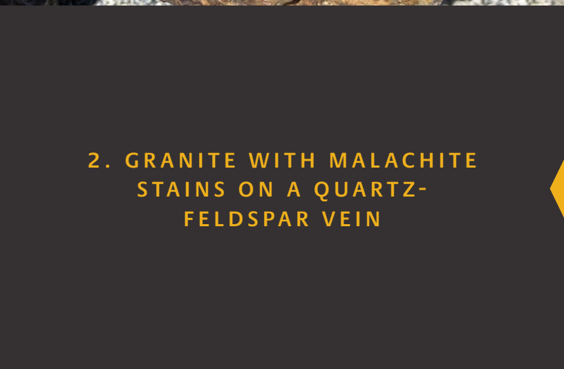
2. GRANITE WITH MALACHITE STAINS ON A QUARTZ-FELDSPAR VEIN