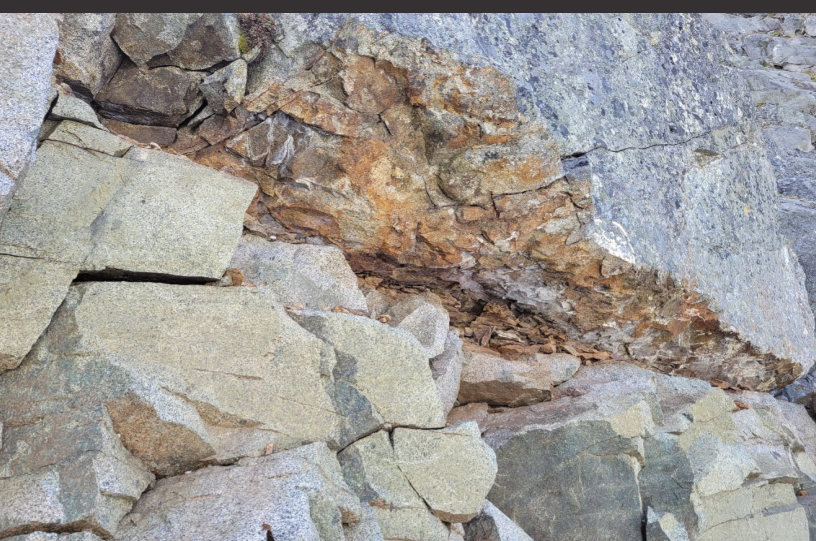
5. QUARTZ VEIN FLOAT WITH MALACHITE STAIN ON OXIDIZED SULPHIDES